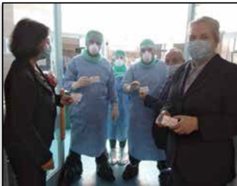
Handover of the vouchers and distribution to the front-line nurses