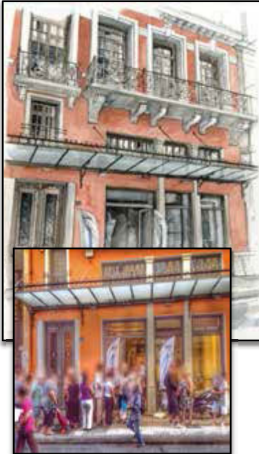
Evripidou 10, Athens 10559 - the busiest distribution point, with almost 7,000 beneficiaries every working day!