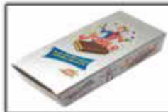
Frou Frou, Joker chocolate biscuits