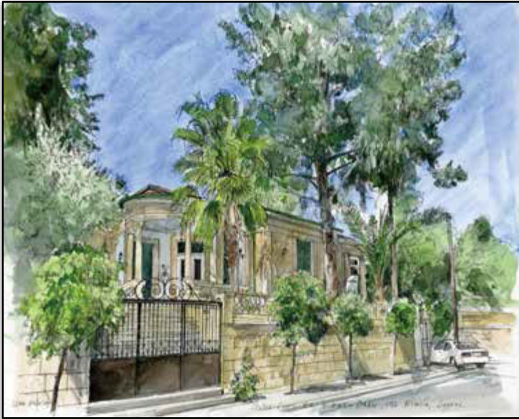
Our offices at Markou Drakou street as depicted in watercolour by artist Liam Wales