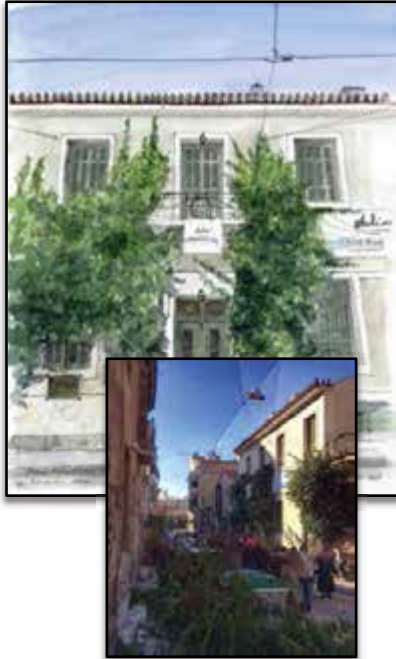
Germanikou 18, Keramikos Athens 10435