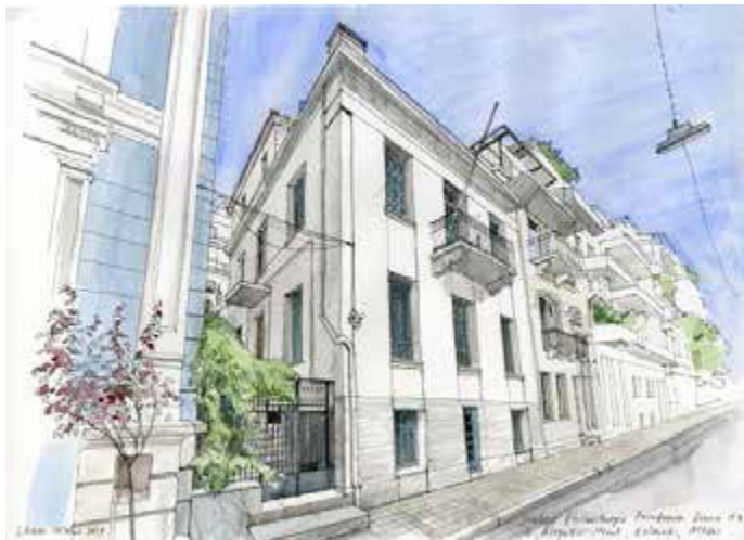
Our new HQ in Greece : Alopekis street 5 , Kolonaki , Athens 106 75