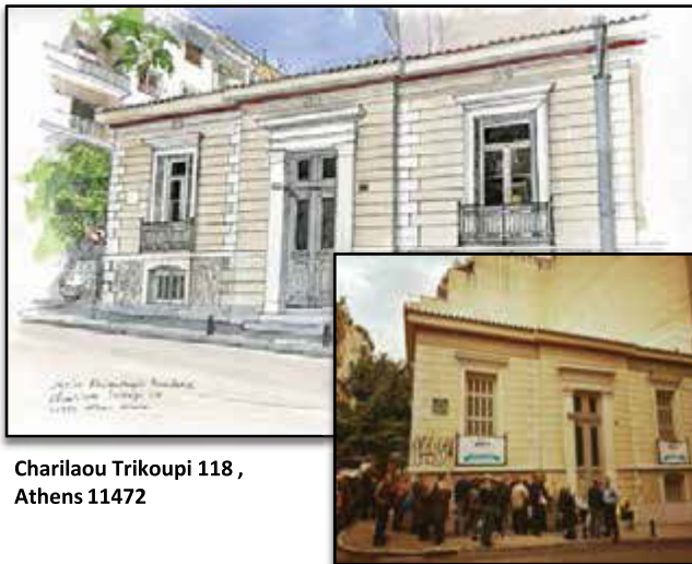
Charilaou Trikoupi 118 , Athens 11472

Depicted in the drawings are the Foundation’s distribution points in Greece and Cyprus. They are accompanied by real-life photos.