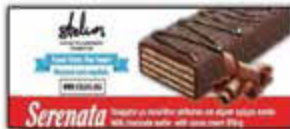
Tottis Serenata wafer chocolate bars